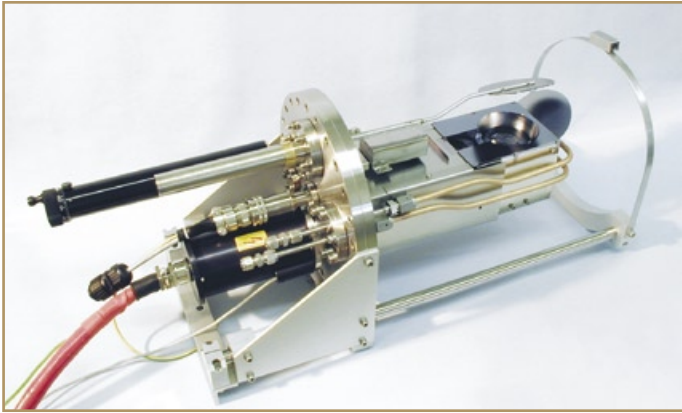
EBV 200-100-SR, electron beam evaporator with 100 cm 3 hearth, manual linear shutter, refill unit & Si shielding parts

Standard Electron Beam Evaporators EBV are single-pocket UHV evaporation sources recommended for use in any application where low vapor pressure materials (refractory metals, semiconductors, oxides, etc.) have to be evaporated at high rates with high purity over a longer period without evaporant depletion. Consequently, hearth capacities of 40 cm 3 and 100 cm 3 , respectively, ensure a long system uptime.