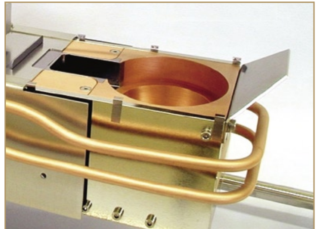
Single-pocket Cu-hearth, capacity 100 cm 3